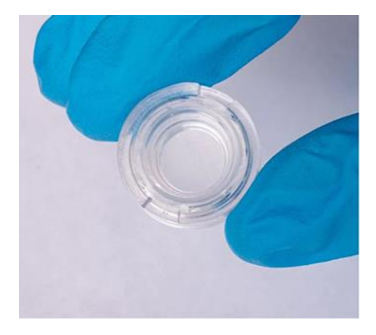
Image captions: CollaFibR<sup>TM</sup> scaffold in 12-well plate format

please visit <u>https://www.amsbio.com/3d-cell-culture-extracellular-</u> <u>matrices/collafibr/collafibr-scaffold/</u> or contact the company on +31-72-8080244 / +44-1235-828200 / +1-617-945-5033 / <u>info@amsbio.com</u>.